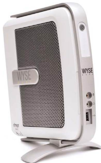
Wyse V10L Thin Client

Thin Client Hardware. Completing the connection to the server's virtual machines is a desktop workstation. While a standard PC may be used for this purpose, most companies that embrace thin computing do so as an alternative to PCs (see sidebar, "The Thin Computing Advantage"). They know that adding even one PC to a thin computing network introduces unnecessary expense and risk. A better choice is a cost-effective workstation such as the Wyse V10L Thin Client, which combines excellent performance, low power consumption and standard PC connections like USB ports in one compact container.